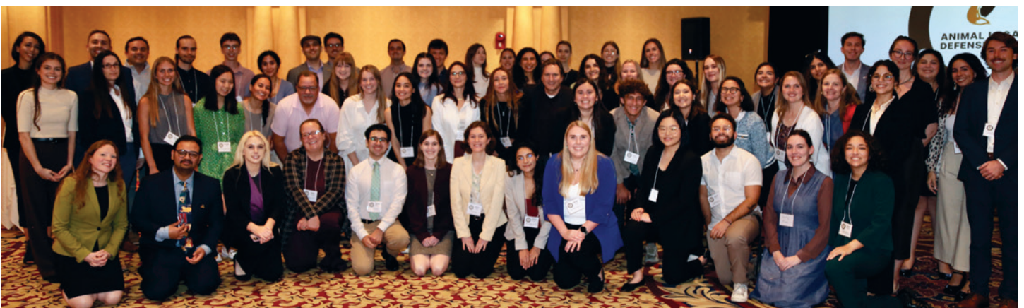
Group photo of Student Convention 2023 attendees.