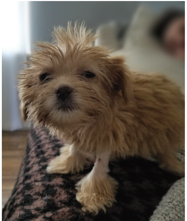
Winnie soon fell ill after coming home with her new family. Despite major veterinary intervention, Winnie did not survive. Like Bear, she’d been sold with a bogus vaccination record and her white fur had been dyed.

While no amount of money can undo a puppy’s suffering, this decision is a monumental one — for these puppies, their families, and countless other animals who stand to benefit when the legal system stands for innocent animals and against their abusers. Learn more at aldf.org/kenney-dogs .