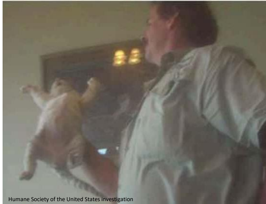
Humane Society of the United States investigation