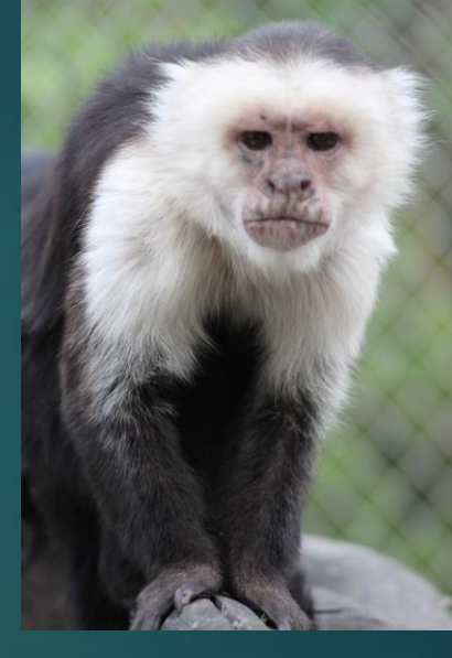
Zeppo and Chico 25 years at PAWS