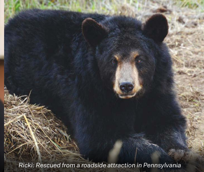
Ricki: Rescued from a roadside attraction in Pennsylvania

Every day, animals like Cali are abused and killed by the people entrusted with their care and well-being. And the law does not always protect animals from harm, nor ensure that animal abusers are held accountable for their cruelty. That's why animals need us fighting to protect them...why they need you .