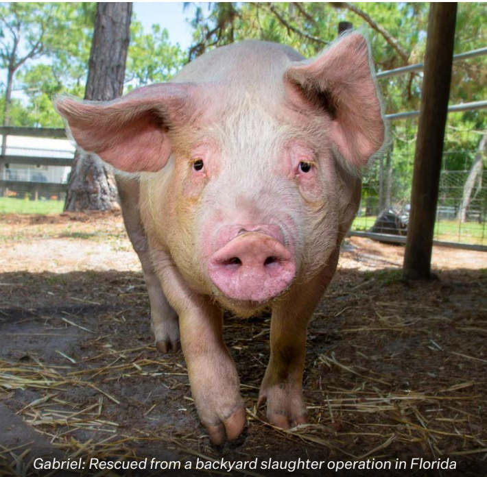
Gabriel: Rescued from a backyard slaughter operation in Florida

You can help animal victims of cruelty all year long by becoming a Partner in Protection today!