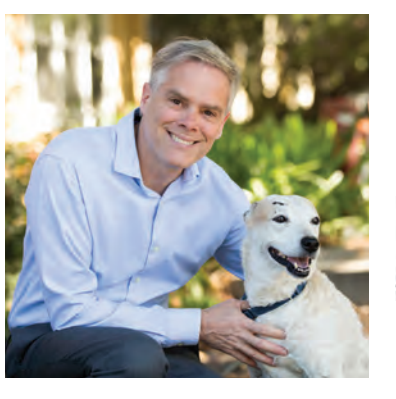
For the animals,

For information about our work and programs, email us at info@aldf.org. Please see "copyright" link on aldf.org for trademark information.